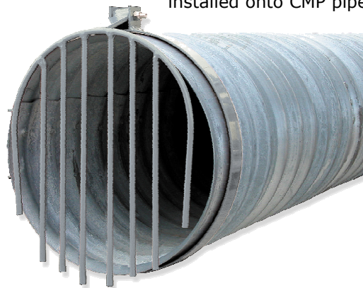
12" Band-Type Rat Guard installed onto CMP pipe.