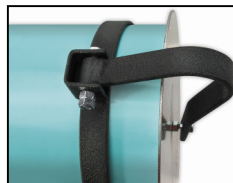
Hinged arm attaches easily with a single bolt.