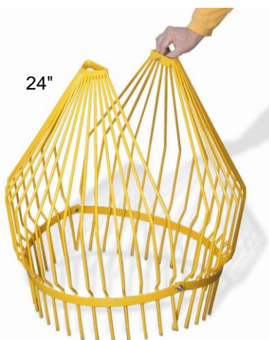
24" - 30" Bar Guards are in two pieces. (Bolts, washers, and nuts are included.)

*Special-sized Bar Guards to fit 12" Hickenbottom Intakes and 15" pipe.