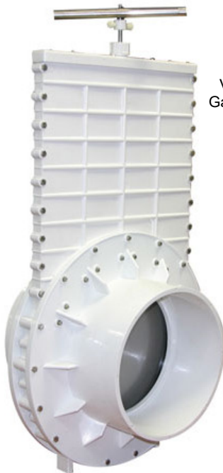
10" Valterra Gate Valve

"B" Dimension is height of valve in fully open position